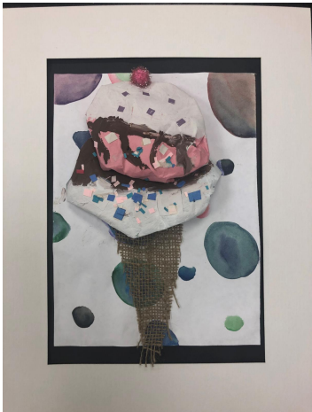
Artist: Lorelai Galloway